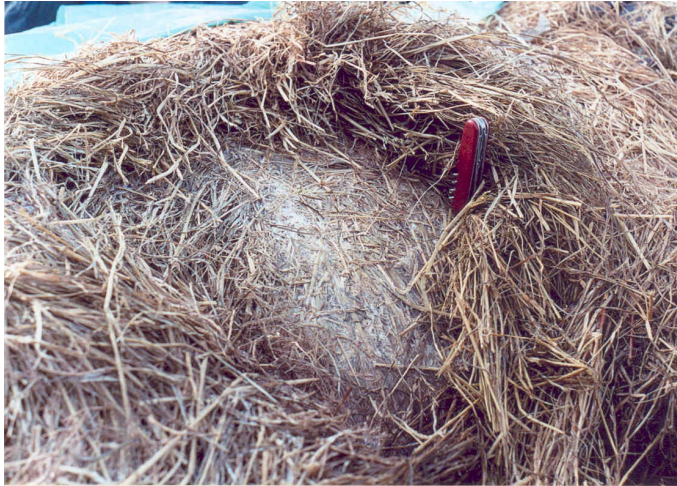
Figure 1. Mould due to presence of air

Solution: Round bale DM should be 40 – 50% DM. Large square bales 40 – 60% DM. Use a chopper baler for over dry bales, with ALL knives in place. Use a fermentation enhancing silage additive for over-wet bales.