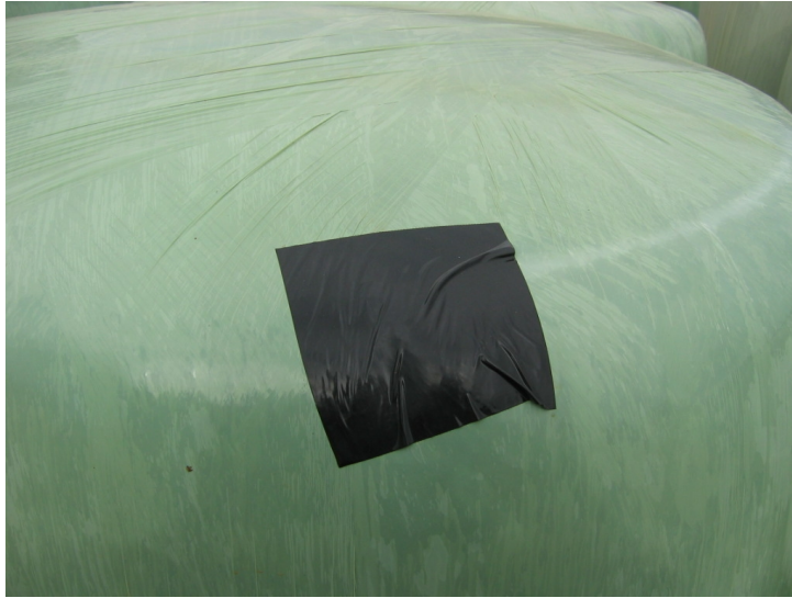
Figure 4. Wrong colour and poor application of black tape on light green film.

Solution: Regularly inspect bales and patch holes as quickly as possible using repair tape specifically designed for plastic wrap. Before applying the patch, clean and dry the holed area, cut the tape to length before applying and apply a similar coloured tape to that of the bale wrap. Avoid doing this in hot weather.