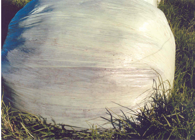
Figure 3. Bale wrap underlapped

Solution: Ensure bales are square or slightly convex in shape. Apply extra wrap over underlapped sections.