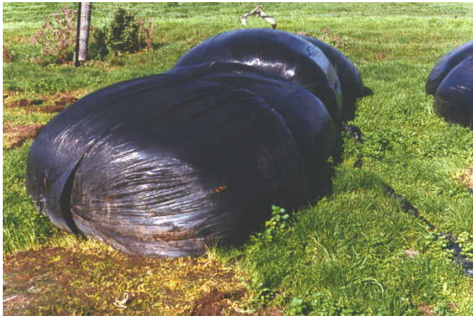
Figure 2. Baled too wet without silage additive