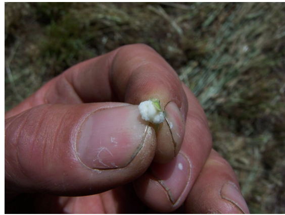
Figure 2. Crackerjack triticale crop at milk - early soft dough stage