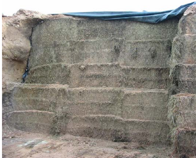
Figure 4. Large square bales in compartments and sealed with soil

Finally, if your drought storage site is not obvious, mark where it is located. During the last drought many farmers, or new farm owners lost track of where their drought storage reserves were located. This drought reserve will have a high value so if the farm is sold you need to know where it is and how much silage is in the pit.