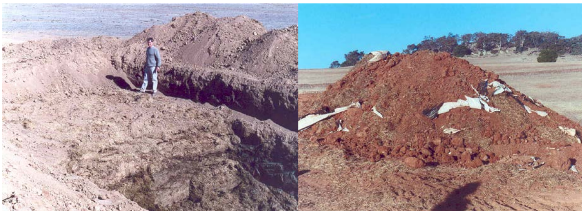
Figure 1. 0.8 m soil removed from stack top Figure 2. Soil contaminated with plastic

Pit or stack silage must be sealed airtight, preferably with plastic sheet and then covered with at least 0.4m to 1m of soil for long term storage ( Figure 1 ). The soil will prevent plastic breakdown from the sun's solar radiation. Place a layer of approximately 150 mm depth of straw/old hay immediately above the plastic before adding the soil. This produces a clean break between the plastic sheet and the soil and avoids plastic contamination of the soil ( Figure 2 ) as it is removed.