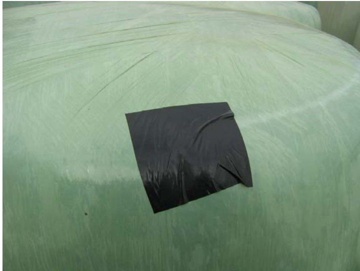
Figure 4. Wrong colour and poor application of black tape on light green film.

Solution: Regularly inspect bales and patch holes as quickly as possible using repair tape specifically designed for plastic wrap. Before applying the patch, clean and dry the holed area, cut the tape to length before applying and apply a similar coloured tape to that of the bale wrap. Avoid doing this in hot weather.