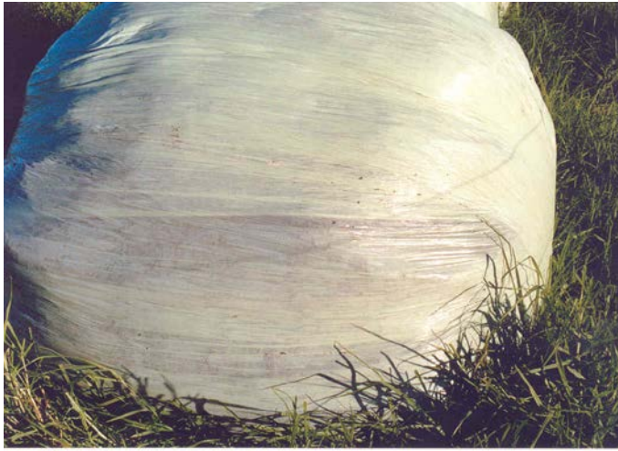
Figure 3. Bale wrap underlapped

Solution: Ensure bales are square or slightly convex in shape. Apply extra wrap over underlapped sections.