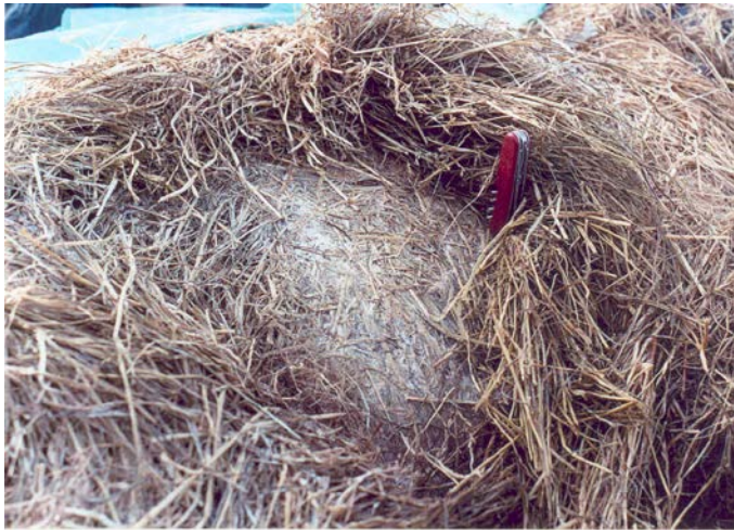
Figure 1. Mould due to presence of air

Solution: Round bale DM should be 40 – 50% DM. Large square bales 40 – 60% DM. Use a chopper baler for over dry bales, with ALL knives in place. Use a fermentation enhancing silage additive for over wet bales.