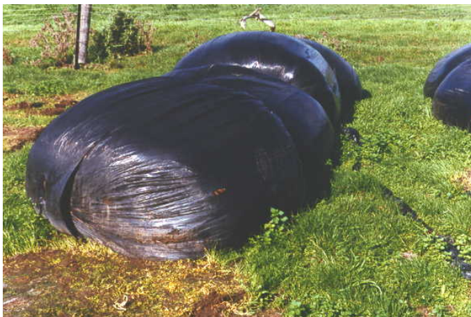
Figure 2. Baled too wet without silage additive