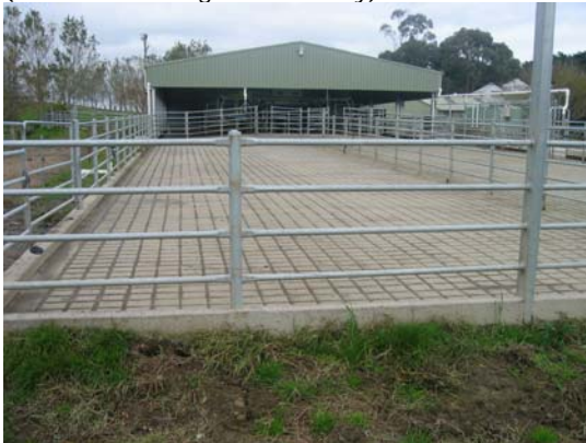
2. Holding yards (from end looking toward dairy)