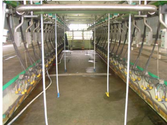
5. Inside Pit (from holding yard end)