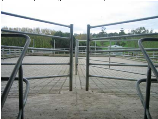
3. Holding yards (from dairy looking towards rear)