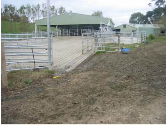
1. Yard Entrance (from track looking into yard)