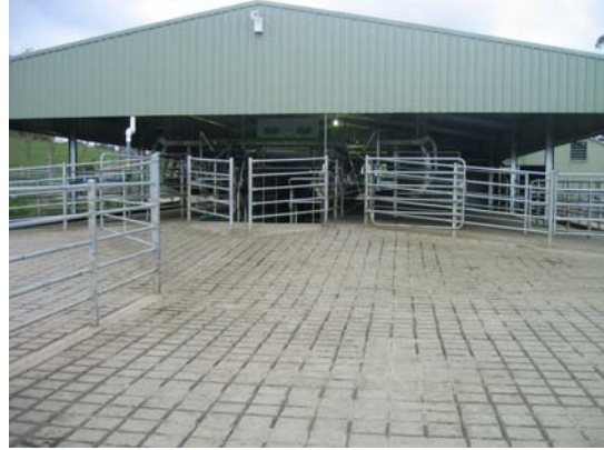
4. Dairy layout / cow entry (looking from yard into dairy)