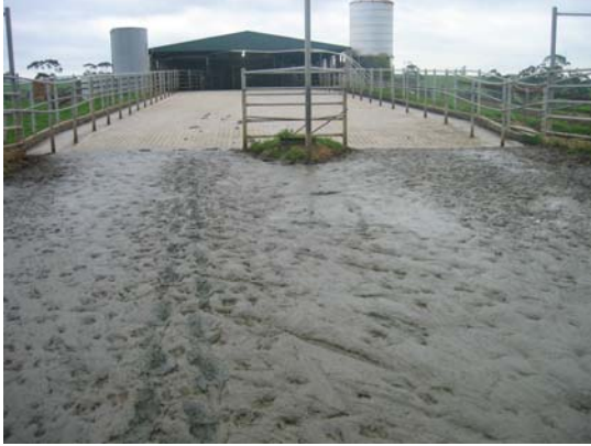
1. Yard Entrance (from track looking into yard)