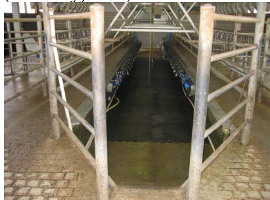
5. Inside Pit (from holding yard end)