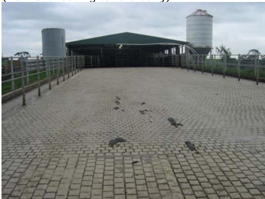
2. Holding yards (from end looking toward dairy)