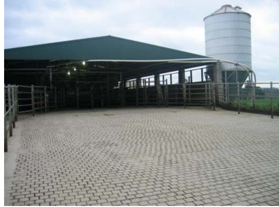
4. Dairy layout / cow entry (looking from yard into dairy)