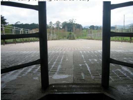
3. Holding yards (from dairy looking towards rear)