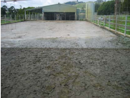
1. Yard Entrance (from track looking into yard)