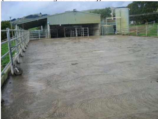
2. Holding yards (from end looking toward dairy)