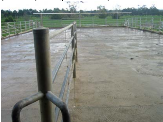
3. Holding yards (from dairy looking towards rear)