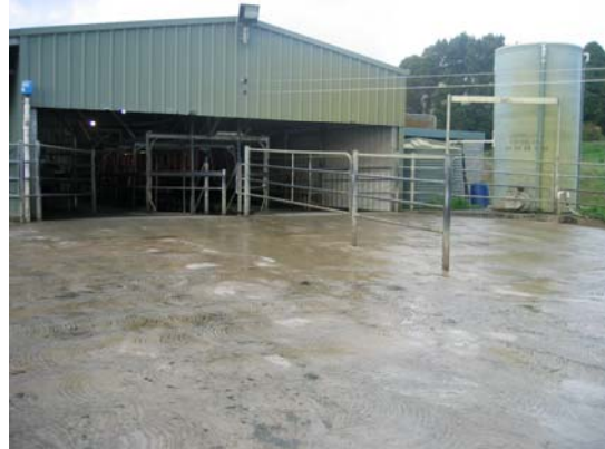
4. Dairy layout / cow entry (looking from yard into dairy)