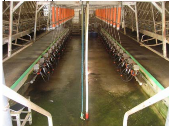
5. Inside Pit (from holding yard end)