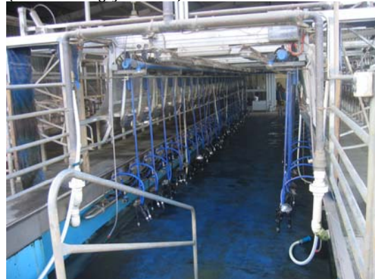
5. Inside Pit (from holding yard end)