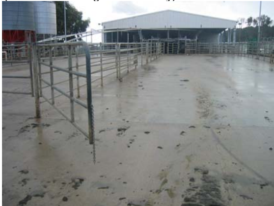
2. Holding yards (from end looking toward dairy)