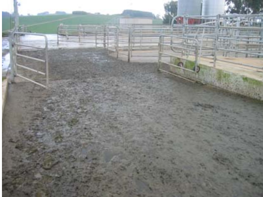
1. Yard Entrance (from track looking into yard)