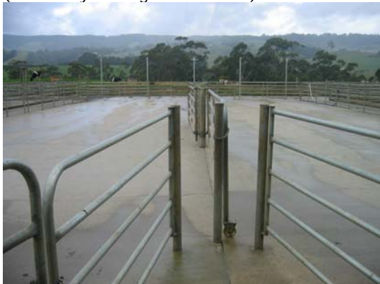
3. Holding yards (from dairy looking towards rear)