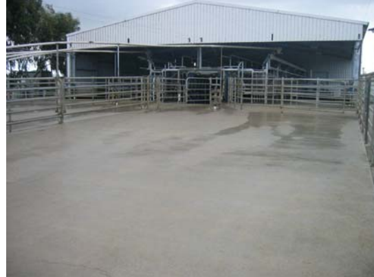
4. Dairy layout / cow entry (looking from yard into dairy)