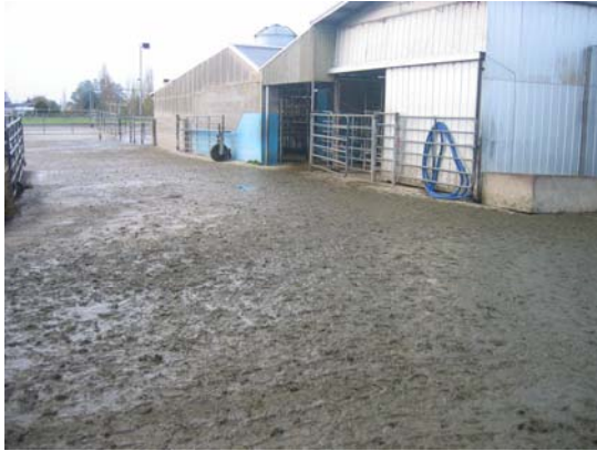
1. Yard Entrance (from track looking into yard)