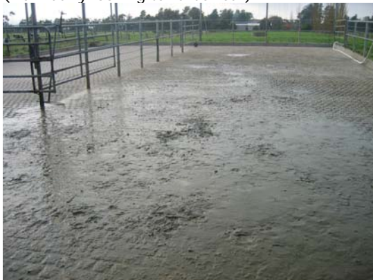
3. Holding yards (from dairy looking towards rear)