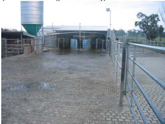
2. Holding yards (from end looking toward dairy)