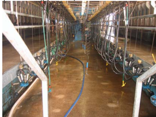
5. Inside Pit (from holding yard end)