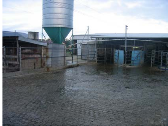
4. Dairy layout / cow entry (looking from yard into dairy)