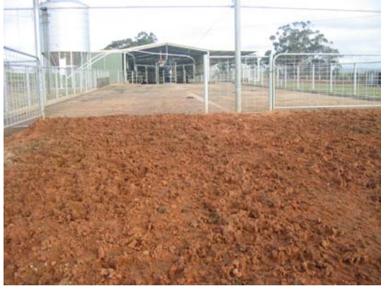
1. Yard Entrance (from track looking into yard)