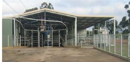
4. Dairy layout / cow entry (looking from yard into dairy)