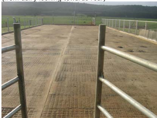
3. Holding yards (from dairy looking towards rear)