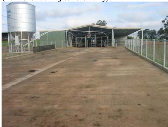
2. Holding yards (from end looking toward dairy)