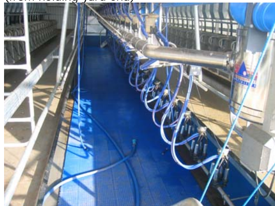
5. Inside Pit (from holding yard end)