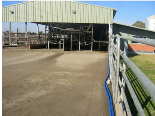
4. Dairy layout / cow entry (looking from yard into dairy)