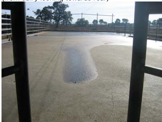
3. Holding yards (from dairy looking towards rear)