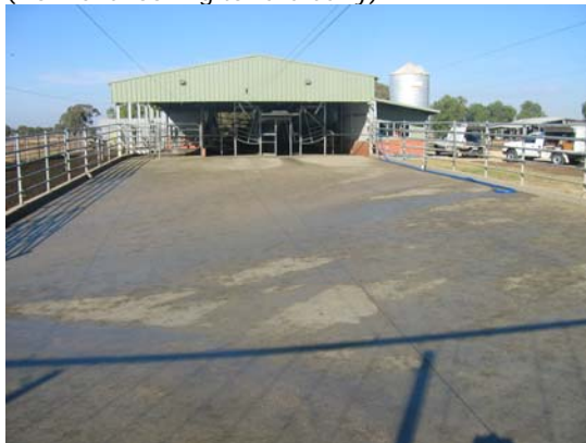
2. Holding yards (from end looking toward dairy)