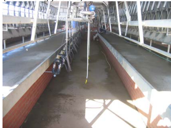
5. Inside Pit (from holding yard end)