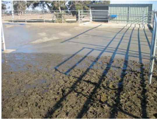
1. Yard Entrance (from track looking into yard)