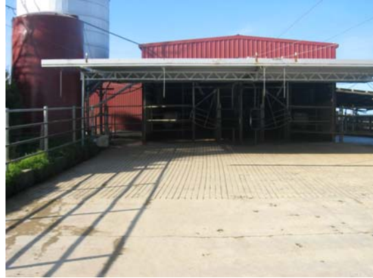
4. Dairy layout / cow entry (looking from yard into dairy)