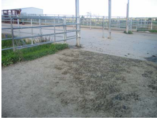
1. Yard Entrance (from track looking into yard)