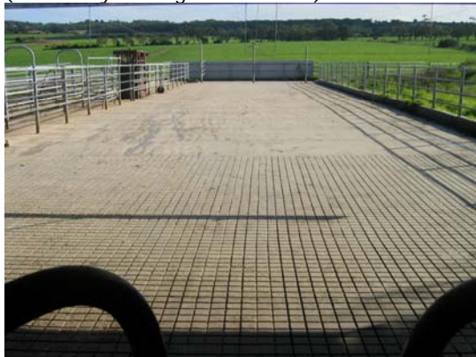
3. Holding yards (from dairy looking towards rear)