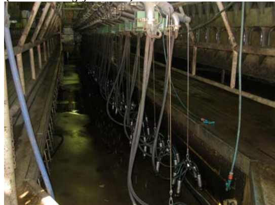
5. Inside Pit (from holding yard end)