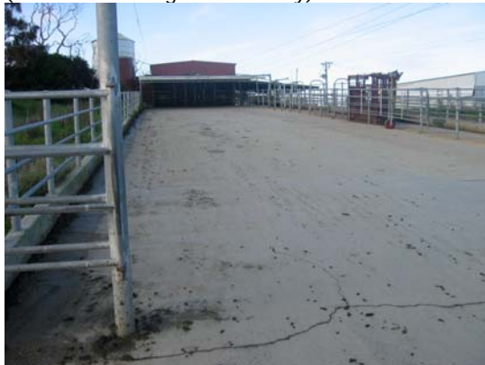
2. Holding yards (from end looking toward dairy)