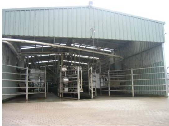
4. Dairy layout / cow entry (looking from yard into dairy)