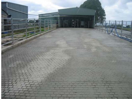
2. Holding yards (from end looking toward dairy)