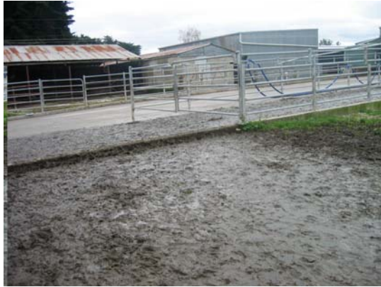
1. Yard Entrance (from track looking into yard)