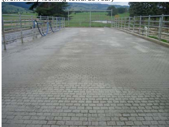
3. Holding yards (from dairy looking towards rear)