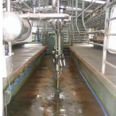
5. Inside Pit (from holding yard end)