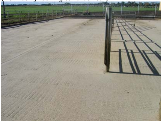
3. Holding yards (from dairy looking towards rear)