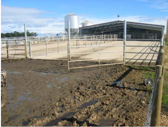
1. Yard Entrance (from track looking into yard)