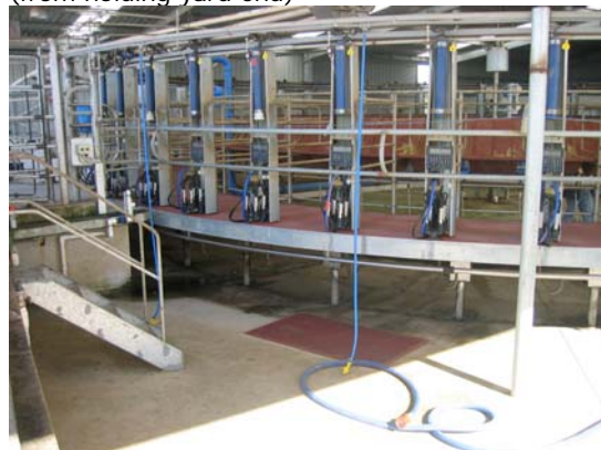
5. Inside Pit (from holding yard end)