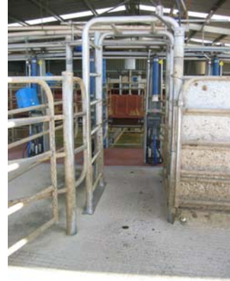
4. Dairy layout / cow entry (looking from yard into dairy)