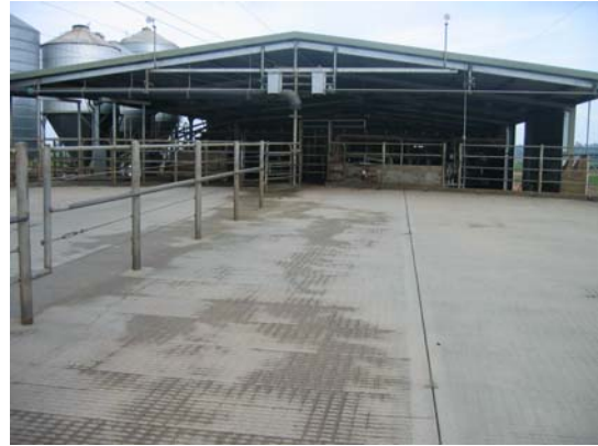
3. Dairy layout / cow entry (looking from yard into dairy)