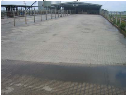
2. Holding yards (from end looking toward dairy)