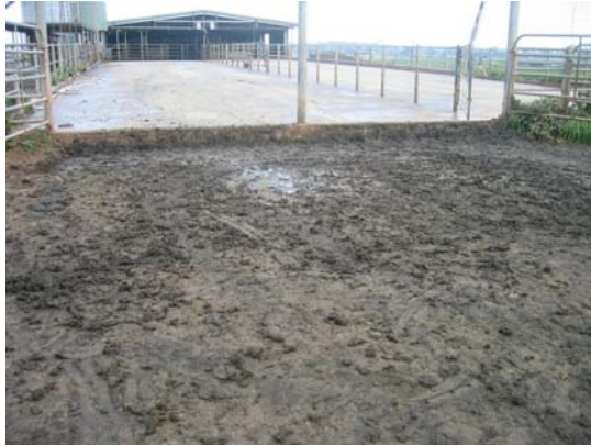
1. Yard Entrance (from track looking into yard)