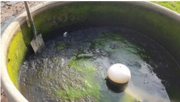
Sludge in bottom of a water trough not drained and cleaned for over two years

If installing or upgrading water troughs, try to use ones which have a large bung/release valve at the bottom so that regular cleaning of the trough is much easier.