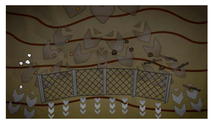
ABOVE: Ensure that the fence line curves downwards at each end so water slows and goes around the fence.

To start building your fence, mark out where it will go with spray or by laying posts on the ground.